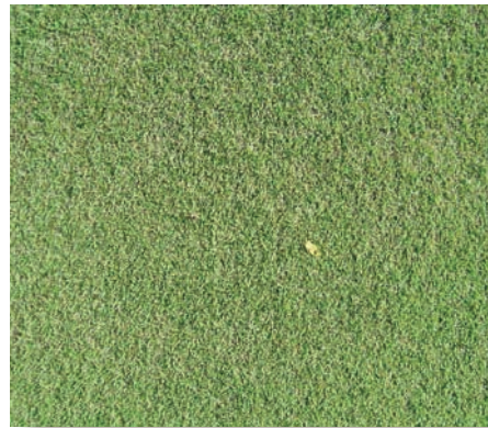
Figure 2. Applications of Acclaim Extra + Spotlight caused 18% to 38% zoysiagrass injury. This photo was taken two weeks after the last product application.

Visual ratings of zoysiagrass injury and