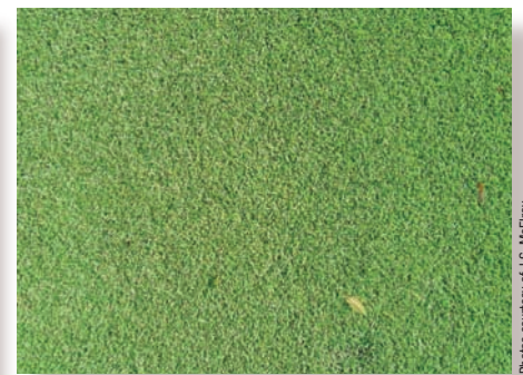
Figure 1. Across experiments, zoysiagrass injury from Turflon Ester alone (left) and from Spotlight alone (right) was 10% or less. These photos were taken two weeks after the last product applications.

regarding Turflon Ester tank-mixtures with Fusilade II or Acclaim Extra on zoysiagrass. Therefore, we investigated the use of Turflon Ester as a selective bermudagrass suppression agent when used with Acclaim Extra or Fusilade II in zoysiagrass turf. Spotlight was also evaluated in this research because its chemistry is similar to that of Turflon Ester and it has recently been registered for use on turf.