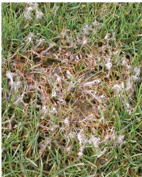
When dollar spot fungi are active, the fungal mycelia, which may resemble a spider web, can be seen on the turf.

→ Soil moisture levels above 25% were associated with an improved ability of each of the three products, Daconil Ultrex, Trimmit 2SC and Primer Select, to suppress dollar spot.