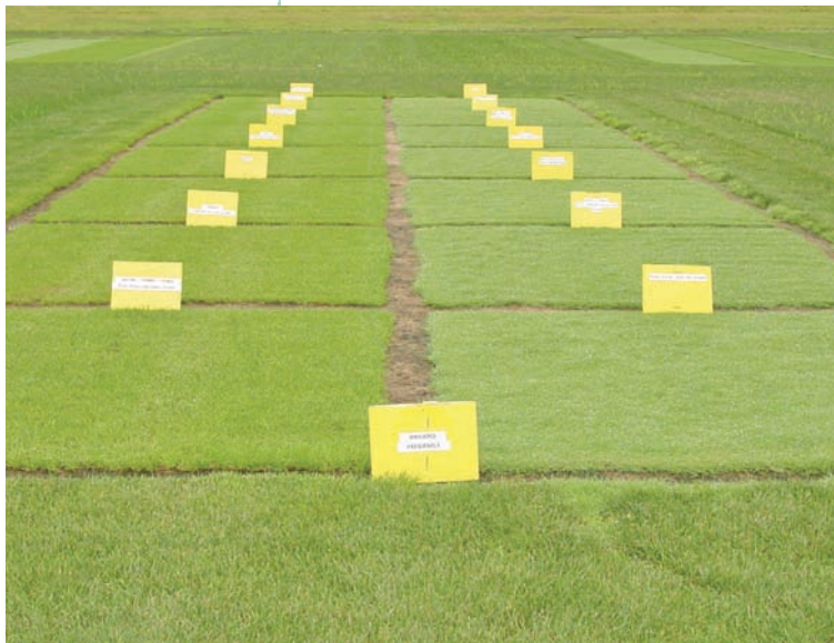
The study site at the University of Maryland Turfgrass Research Facility in College Park consisted of eight independently irrigated blocks.