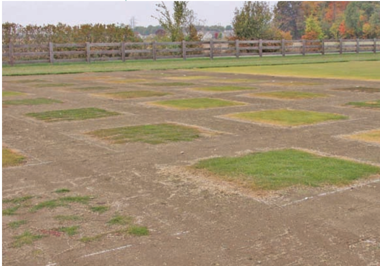
Some zoysiagrass cultivars establish faster than others (bottom left vs. center), as evident in this NTEP trial.

establishment rate than the older Emerald ( Z. japonica × Z. pacifica Goudsw.), which is similar in color, texture and density to Z. matrella (7). These results indicate that newer cultivars exist or are being developed with rapid establishment rates. Planting newer cultivars with improved establishment rates could dramatically reduce the time, inconvenience and cost of establishing zoysiagrass on golf courses.