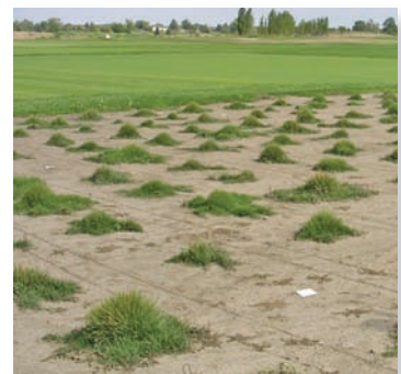
The test plots for the zoysiagrass establishment rate research after final data collection was completed in September.