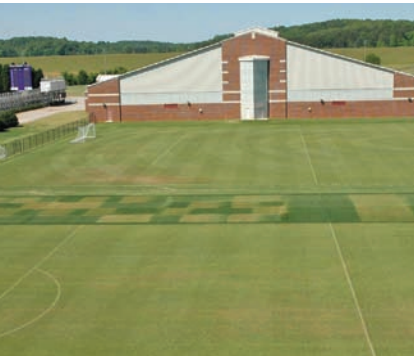
An aerial view of plots from study 2 (2007) taken in early May. All plots treated with herbicide in mid-April have unacceptable turf quality.