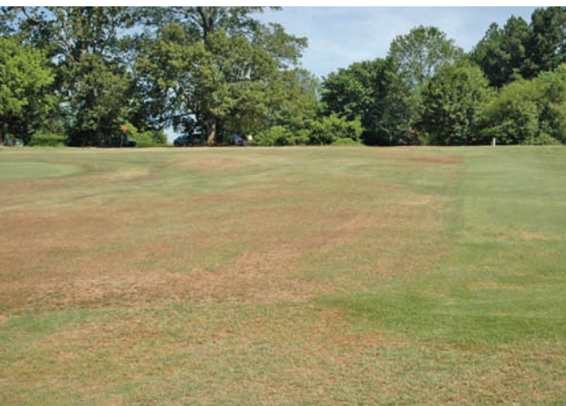
An example of an unacceptable spring transition. Left, The overseeded perennial ryegrass abruptly transitioned, exposing a weak and unsightly bermudagrass base. Right, Bermudagrass that was not overseeded had acceptable turf quality.