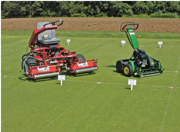
Lightweight vibratory rolling (left) and mowing practices (right) were tested to determine their effect on anthracnose and putting green speed.

the objectives of this field trial were to evaluate mowing height, mowing frequency, lightweight rolling and the potential interaction effects on anthracnose severity and green speed of annual bluegrass maintained as putting green turf.