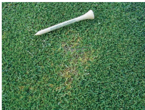
Anthracnose generally begins as 0.25- to 0.50-inch chlorotic (yellow) patches that coalesce to affect larger areas of turf.

Lightweight rolling is another practice used to increase green speed by smoothing and improving uniformity of the turf canopy (8). Rolling more than three times per week reduced turf quality in