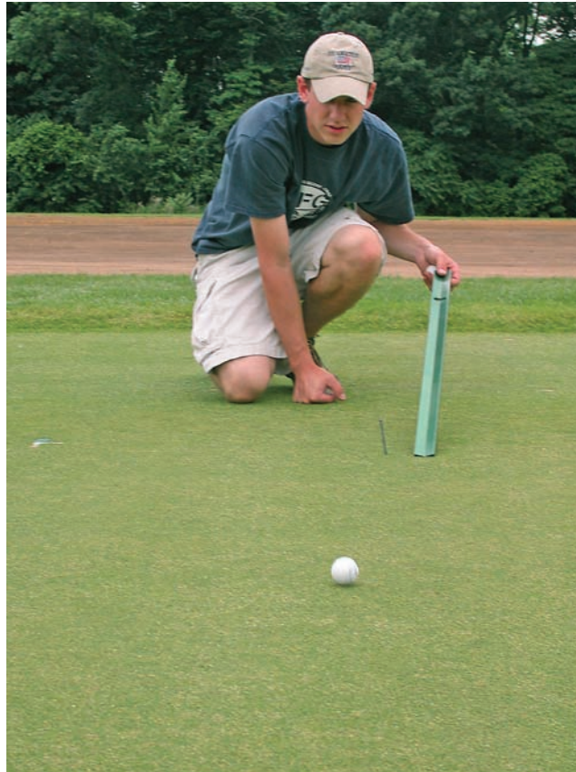
Numerous combinations of mowing height, mowing frequency and lightweight rolling routinely produced green speeds of 9.5 to 10.5 feet before anthracnose symptoms developed.

→ A comprehensive management program integrating these practices with moderate nitrogen fertility may reduce the quantity and/or increase the application interval of fungicides required to provide acceptable disease control.