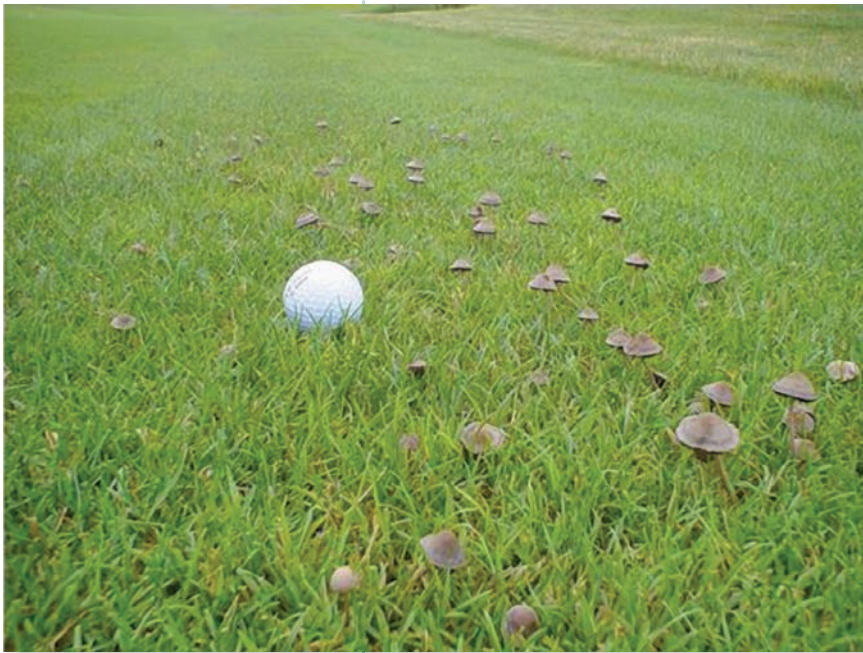
Example of type III fairy ring symptoms in turf.

All treatments were applied from flat-fan nozzles in 4 gallons of water carrier/1,000 square feet (163.0 milliliters/square meter), followed by 0.1 inch (2.54 millimeters) overhead irrigation. All treatments were applied July 1 and again July 30, 2003.