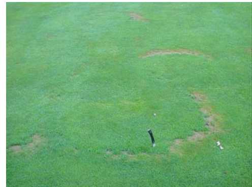
Example of type I fairy ring symptoms in turf.

The treatments used in the California study were repeated in 2006 on a perennial ryegrass